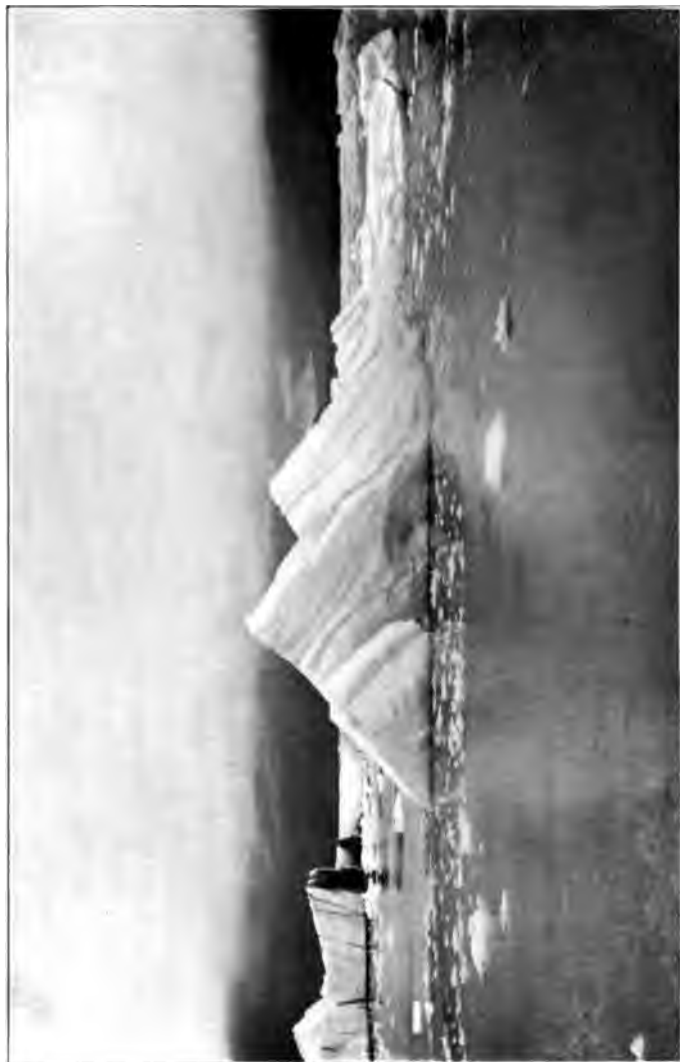
GLACIER BAY, WITH ICEBERG